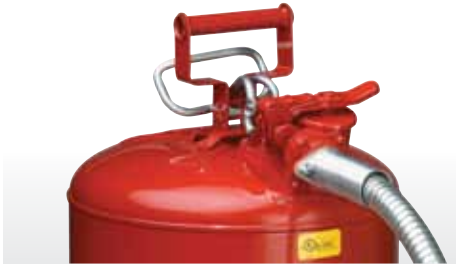
Type II Safety Can Two openings: top opening with lift lever for filling, and a second one with flexible metal hose attached for controlled, plug-free dispensing into smaller openings.

Type I and Type II Safety Cans are required by OSHA when used by any business or commercial enterprise.