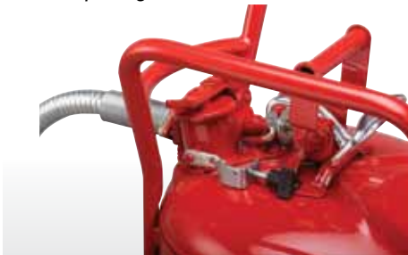
Type II D.O.T. Safety Can Two openings: top opening with lift lever for filling, and a second one with flexible metal hose attached for accurate, plug-free dispensing into smaller openings. Additional safety features include roll-bar construction and a fusible-link protected hold-down bracket for protection during over-the-road transport.

Type II D.O.T. Safety Cans are required by the Department of Transportation and OSHA for use in any commercial vehicle when transporting flammables on public roads and highways (some exceptions may apply).