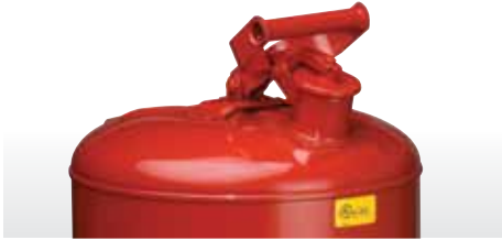
Type I Safety Can One opening from which to fill and pour into larger receiving vessels.

Styles of safety. The various types of safety cans are often defined by the lid design and methods of filling and pouring.